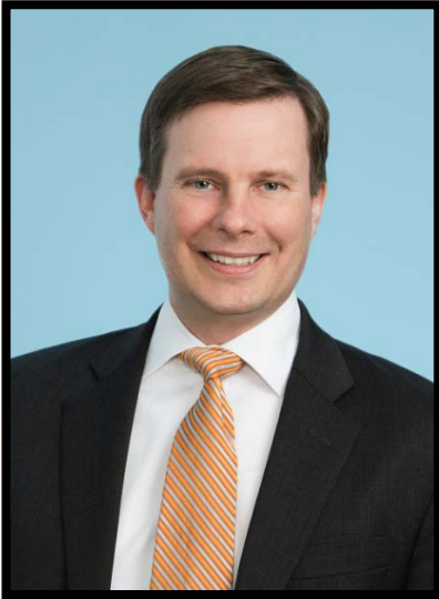
Partner Pillsbury Winthrop Shaw Pittman LLP