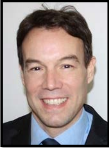
Legal Officer Non-Proliferation and Policy Making Section, Office of Legal Affairs, International Atomic Energy Agency (IAEA)