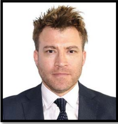
Legal Officer, Nuclear and Treaty Law Section, Office of Legal Affairs, International Atomic Energy Agency (IAEA)