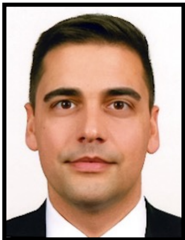
Group Senior Legal Counsel NKT