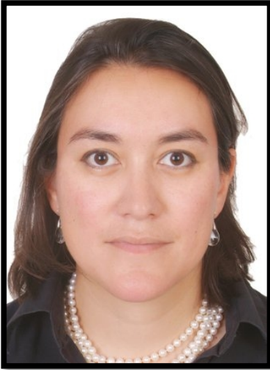
Head Office of Legal Counsel, Nuclear Energy Agency