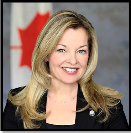
Senior General Counsel Canadian Nuclear Safety Commission