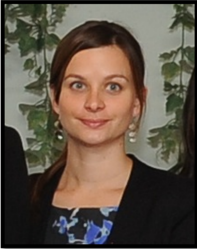
Programme Director for National Implementation, Verification Research, Training and Information Centre (VERTIC)