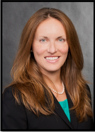
Deputy Head Office of Legal Counsel, Nuclear Energy Agency