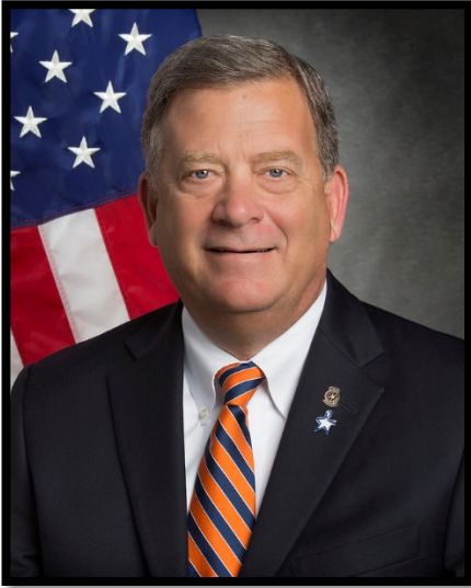
Commissioner US Nuclear Regulatory Commission