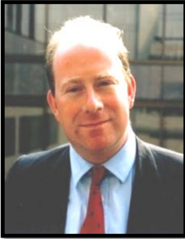
Insurance consultant and former Managing Director Power Nuclear & Construction Division, Price Forbes & Partners Ltd