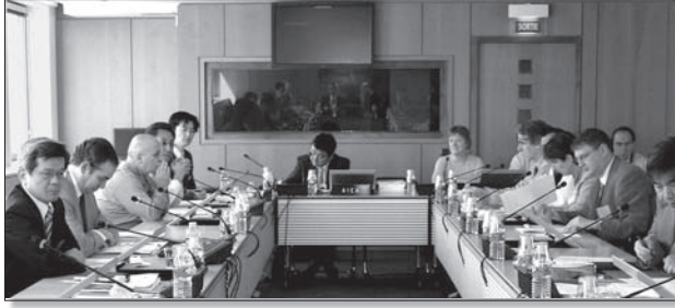
The first meeting of the SCAP Management Board, in June 2006.