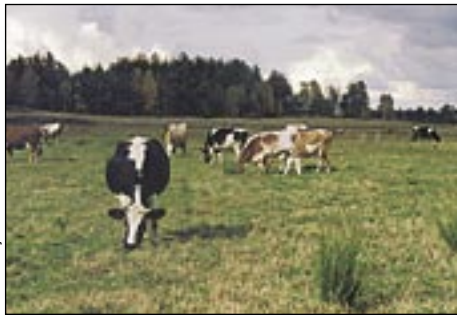
Cows grazing on land affected by the Chernobyl disaster in Belarus.

4.5 million people were living in areas considered to be contaminated from radioactive material from the Chernobyl accident (that is, a level of ^{137}\text{Cs} of 37 kBq \text{m}^{-2} or more). From an initial number of over 230 000 people, in 1995 there were 193 000 people who continued to live in radioactively contaminated areas where deposition levels of radiocaesium ( ^{137}\text{Cs} ) exceed 555 kBq \text{m}^{-2} , the level established by Soviet Authorities where protection measures are required to reduce radiation exposures to