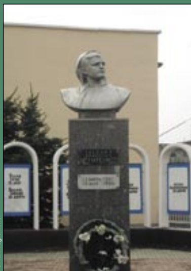
Memorial to a fireman who died as a result of the Chernobyl accident.