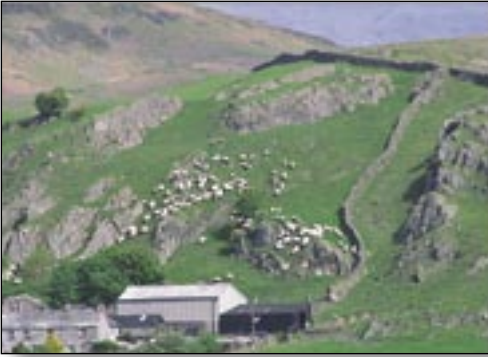
Sheep hillfarm in the United Kingdom, typical of the areas restricted following the accident at Chernobyl.

recent data, from July 2005, there are 81 400 hectares in the United Kingdom still covered by restrictions, affecting the movement and slaughter of over 220 000 sheep. These restrictions affect 382 farms, of which 359 are in Wales. Although the strategy adopted in the United Kingdom to tackle this situation (including direct compensation) has allowed sheep farming to continue in these areas, these restrictions place an additional burden on an already marginal industry and still require dedicated monitoring schemes (UKFSA, 2005; NRPB, 1999).