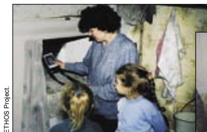
ETHOS Project. Monitoring for radioactivity in an oven.

The success of this approach depends in no small measure on the ability of radiation protection professionals, as part of a multi-disciplinary team, to create the conditions within which ongoing engagement with mothers and families generally may take place. This marks a step change from simple information giving – something that had characterised the top-down approach and which was widely acknowledged to have had, at best, only a very limited impact. Radiation protection professionals certainly have knowledge to contribute, but this is in the setting of a joint effort with other stakeholders, including other professionals, where all are playing a role in defining the problems and developing solutions in a specific context.