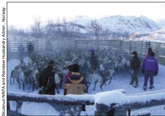
Reindeer herders in Vågå selecting animals for slaughter.

in central and southern Norway, covering an area of about 2 460 000 hectares, implemented countermeasures to comply with the current intervention limit of 3 000 Bq/kg in slaughtered animals. About 30% of all sheep in Norway were subjected to countermeasures in 1986, of which about 3% (about 2 300 tons of mutton) was found unfit for human consumption. The number of sheep subjected to countermeasures was reduced about ten-fold from 1986 to 1995, and in 2004 in total about 12 000 sheep in 34 of Norway's 434 municipalities were clean fed before slaughter. Although most costs for the reindeer herders and farmers are compensated by the authorities, the contamination is having an adverse impact on the effort required to manage the herds (Skuterud, 2005; NEA, 2002a).