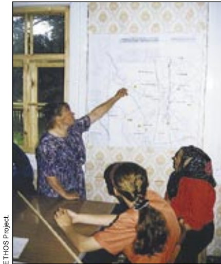
Mapping contamination in Belarus.

While the return in terms of trust, effectiveness and efficiency can therefore be significant, careful initial investment is needed in terms both of appropriate equipment and training that is adapted to local circumstances, and of careful selection of personnel who enjoy the confidence of those they will serve. Equally, if local monitors are to fulfil their undoubted potential, then they will need ongoing support. All of this certainly faces the radiation protection community with new challenges in terms of its relationships with those whom it serves. But, as the post-Chernobyl experience shows, if these challenges are met, then the rewards can be significant.