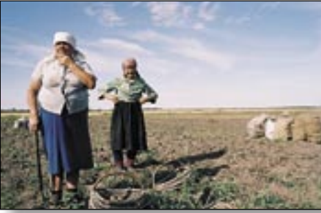
Agricultural workers in their fields, Belarus.

ensure that those responsible for the land, especially farmers, are given the information and the skills to operate in the new environment they find themselves in. In this regard, radiation protection professionals will need to move beyond a role of pure measurement and information giving and towards a position where they engage actively with farmers in defining the problems they face and developing workable solutions which respect local constraints.