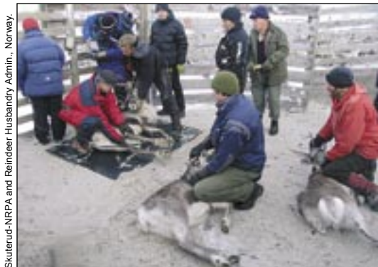
Skuterud-NRPA and Reindeer Husbandry Admin., Norway.

Live monitoring of reindeer before slaughter in Norway, December 2005. These animals were not slaughtered in September 2005 because concentration values were above the intervention limit of 3000 Bq/kg (the maximum value reaching 7 000 Bq/kg).