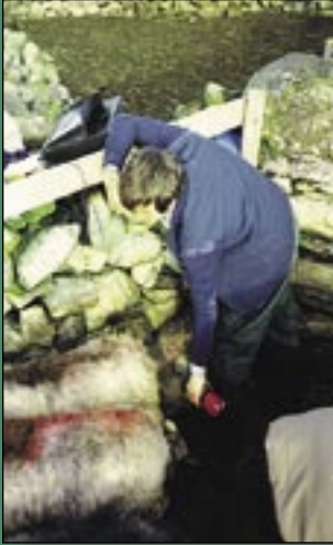
Beresford-CEH, Lancaster, United Kingdom.

A key response from the Ministry of Agriculture, Fisheries and Food in the United Kingdom has been the monitoring of sheep on farms in the upland areas most affected by the Chernobyl accident. This so-called “Mark and Release” scheme ensures no meat with more than 1000 Bqkg -1 radio-caesium enters the human food chain.