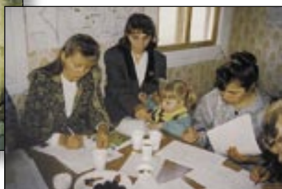
ETHOS Project. Mothers planning their children's diet to reduce radiation exposure.