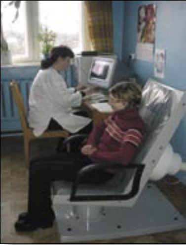
Full body monitoring at a local clinic in Belarus.

These advances required an effort on the part of all concerned – radiation protection professionals, doctors and the communities they serve – to develop the conditions for dialogue and interaction beyond the confines of a doctor’s office. The impact of the doctors’ role is maximised where they are able to engage with radiation protection professionals and communities in decisions affecting agriculture, education, and every other aspect of daily life that is affected by the presence of contamination – in other words, a multidisciplinary and integrated approach is key to success in responding to the challenges of contamination. Insofar as radiation protection professionals have been able to assist in the creation of these