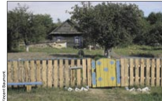
Typical homestead in the contaminated territories. (Belarus)

Similarly, in the United Kingdom, recognising that restrictions on sheep farming were not simply a matter of radiological effectiveness, the authorities involved a range of stakeholders to review the options. The finding was that considering regulatory techniques solely from the point of view of radiological effectiveness was inadequate and that factors such as direct cost, lost opportunity cost, building costs and planning permission, machinery cost and availability, time and trouble and preservation of the landscape and habitat were all important. A measure of success of this exercise is that a stakeholder working group was subsequently established to consider responses should a similar contamination event ever occur again. In turn, the success of this initiative may be gauged from the fact that this approach has also been taken forward at the international level through the European Commission sponsored “FARMING” network.