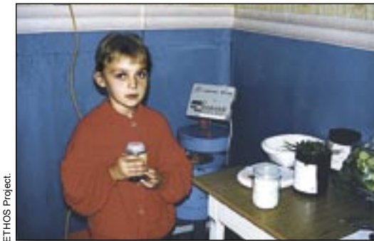
Monitoring radiation in a local centre for radiological control in an area of Belarus directly affected by the accident.

full, however, requires a change in the structures within which local administrations operate, allowing them sufficient flexibility and freedom to engage stakeholders while at the same time ensuring that they play their role as part of the bigger picture and contribute to higher level goals.