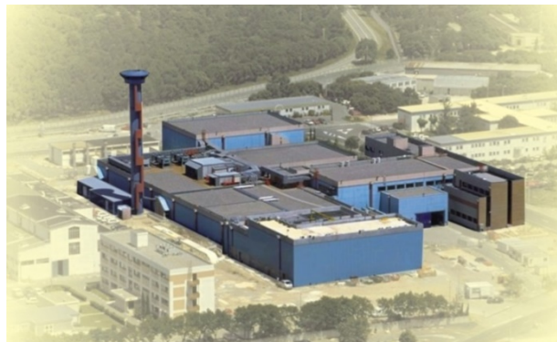
Figure 2. View of ATALANTE facility