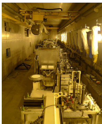
Figure 4. Process cell