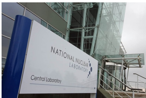
Figure 14. Front face of the Central Laboratory, Sellafield