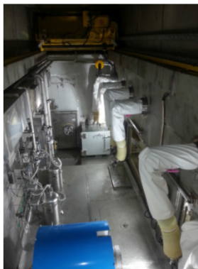
Figure 9. Process cell (air)