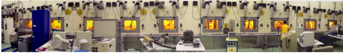
Figure 6. Operation area