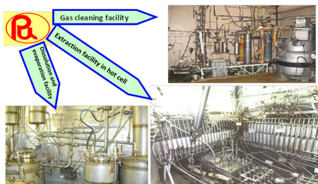
Figure 12. Different facilities in Gatchina

The aim of the R&D programme conducted in REC in Gatchina is to develop innovative advanced reprocessing processes in order to optimise the cost, decrease the environmental footprint and improve existing technologies for various types of spent nuclear fuels. These technologies are based on advanced aqueous processes and are also developed for isotope production for nuclear medicine and other industries.