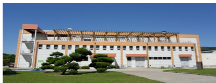
Figure 3. Outside view of PRIDE