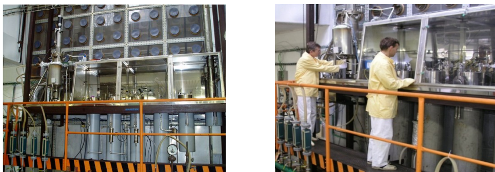
Figure 1. Views on the FERDA line