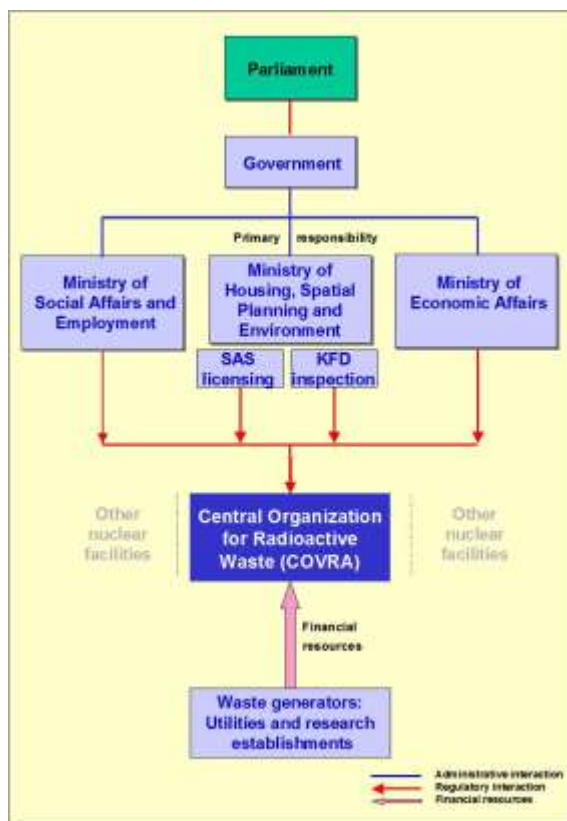
Figure 1. Organization of the regulatory body.

All activities with radioactive materials (import, transport, use, treatment, storage, disposal), are regulated under the Nuclear Energy Act and in most cases a license is required.