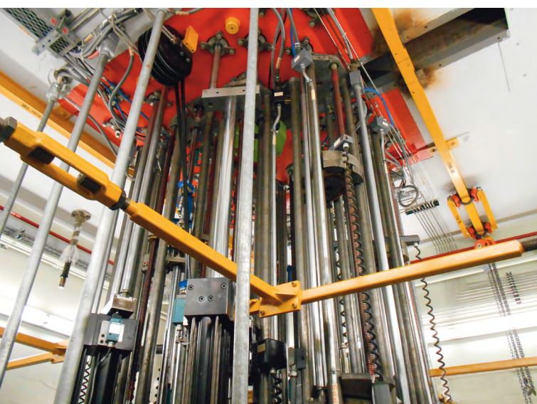
TREAT Reactor at INL.

Email: FIDES@oecd-nea.org or visit www.oecd-nea.org/fides-ii .